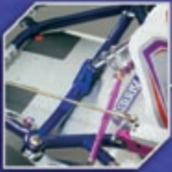
Solid beam front end