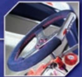
Arrow silver flat top suede steering wheel with embroidered Arrow logo