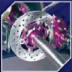
Ventilated 18mm wide brake disc & machined billet alloy 2-spot caliper