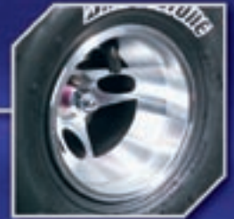
One-piece machined alloy 3-spoke wheels