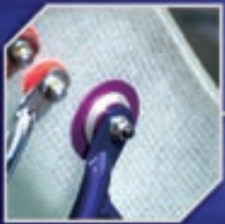
Arrow's unique self-centering seat washers