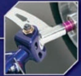
Adjustable camber/caster and front ride height