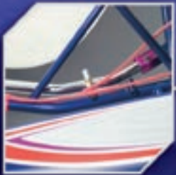
Removable side torsion bar