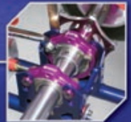
Rear axle supported by three bearings

Due to constant development, specifications may change without notice