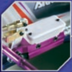
Machined billet alloy brake master cylinder